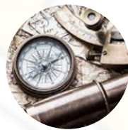
History & Humanities