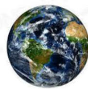
Can'n & World Studies